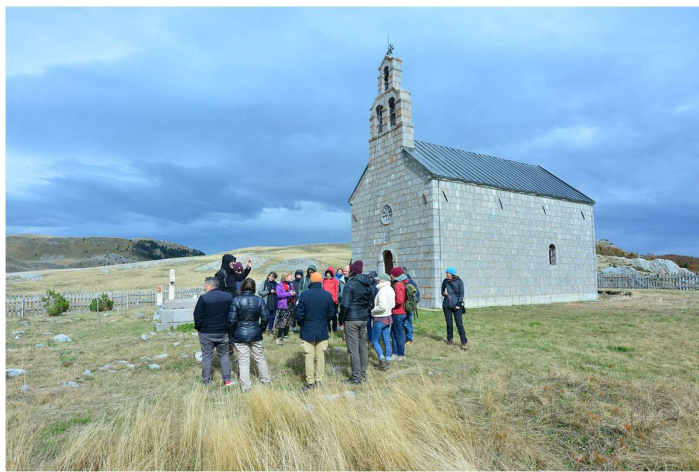
Visit to katun Okrugljak, Ružica church