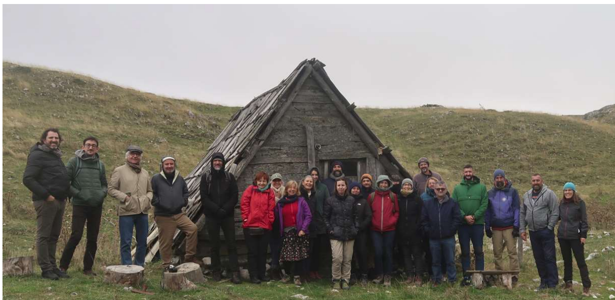
Participants of the field trip in katun Bunarine